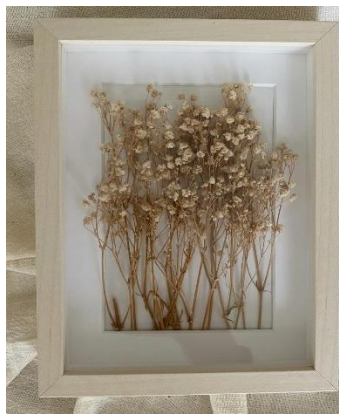
Framing Example: To ensure the safety of works such as jewelry, the City recommends using a shadowbox frame to ensure works are secured to the wall.