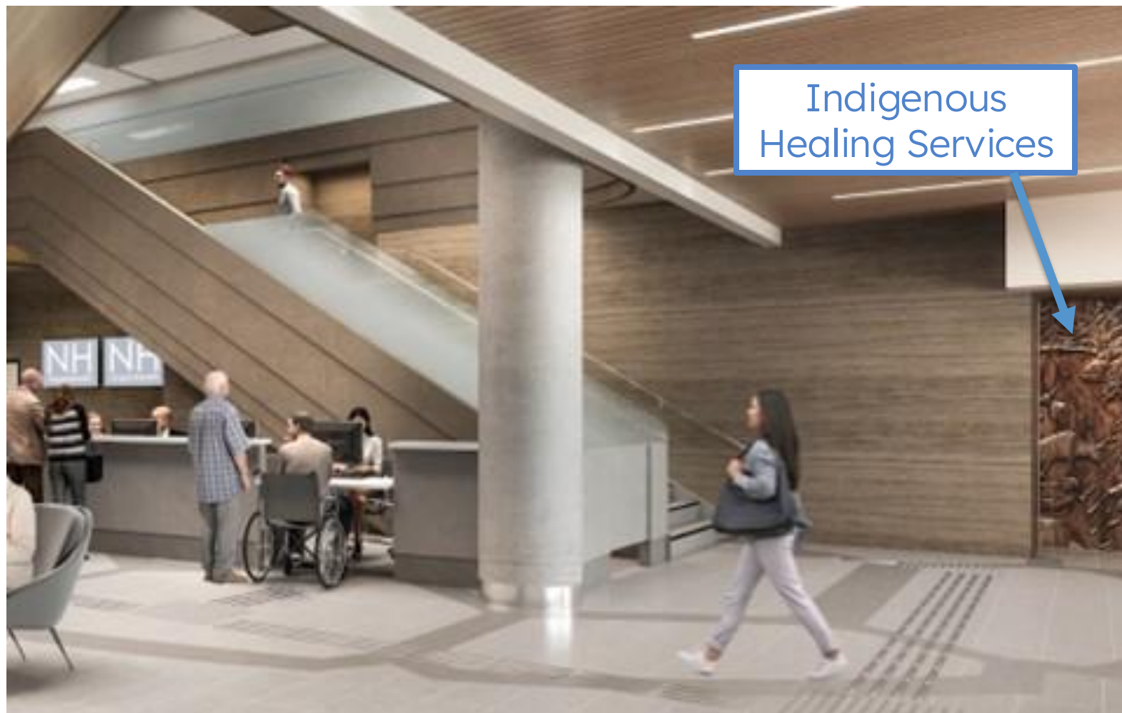
Context Rendering* – Lobby Side

Double Door 1930mm width by 2134mm height, thickness to be determined.