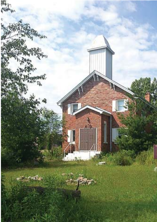
Figure 11. The Council House as it appeared in June 2013.

building a short distance away. The council house now serves as the Cultural Committee's headquarters, and provides office space for a variety of tenants who provide services to the First Nation and surrounding community [Figure 10].