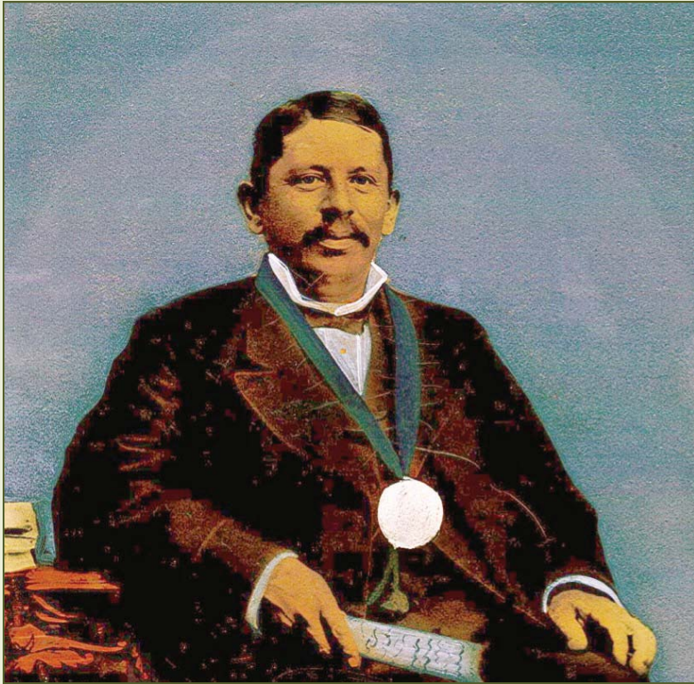
Figure 3. Kahkewaquonaby—Chief Dr. Peter E. Jones of the Mississaugas of the Credit