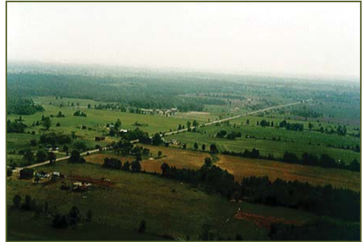
Figure 4. A bird's eye view of the council house circa 1985. The council house is located at the crossroads—the centre of New Credit lands in Tuscarora Township, Brant County

The council house had a commanding presence, and dwarfed all but the mission church, the oldest public building on the reserve. Constructed on well-drained ground at the geographic centre of the New Credit lands in Tuscarora Township, the council house was situated on a rise of ground set aside for that purpose [Figure 4]. The building was a solidly built structure of red brick on a stone foundation with tall arched windows and a cupola. The estimated cost of construction was initially