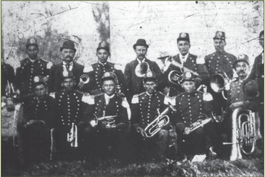
Figure 1. New Credit Brass Band at official opening of council house—September 15, 1882