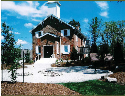
Figure 9. Council house, 2007 (photo by Paul O'Hara, Mississaugas of the New Credit First Nation Collection)

when it became a small cog in the automotive industry. The Van Dressler Company of Waterloo, Ontario, in cooperation with New Credit council, established a factory for the manufacture of burlap contours for the bottom of car seats. Eight women reported for work in the council house and their efforts relieved pres-