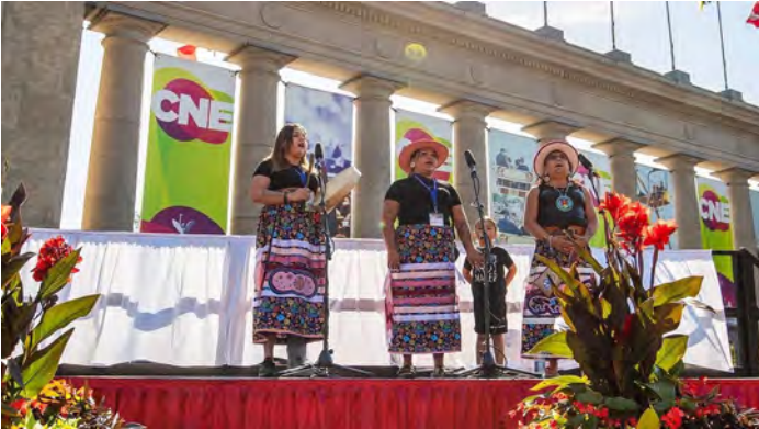
Manitou Mkwā Singers at the CNE opening ceremonies!