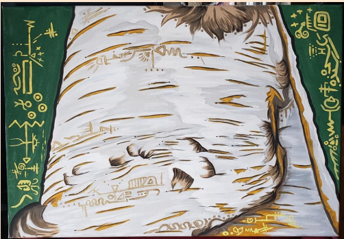
Birch Bark Scroll