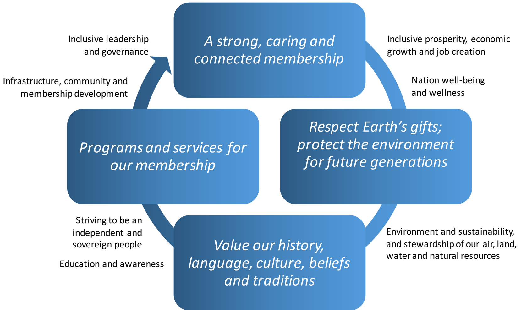
The Virtuous Circle: Our holistic, integrated and self-reinforcing Strategic Plan Four core values supported by seven key pillars